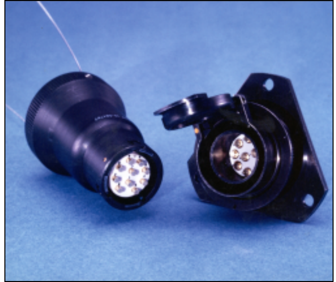
Gatelink Plug and Receptacle